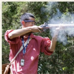
BLACK POWDER RIFLE SHOOT