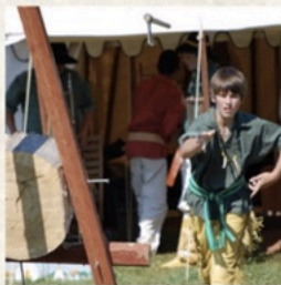
KNIFE & HAWK THROWING